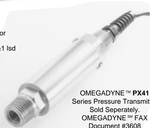
OMEGADYNE™ PX41 Series Pressure Transmitter Sold Separately. OMEGADYNE SM FAX Document #3608